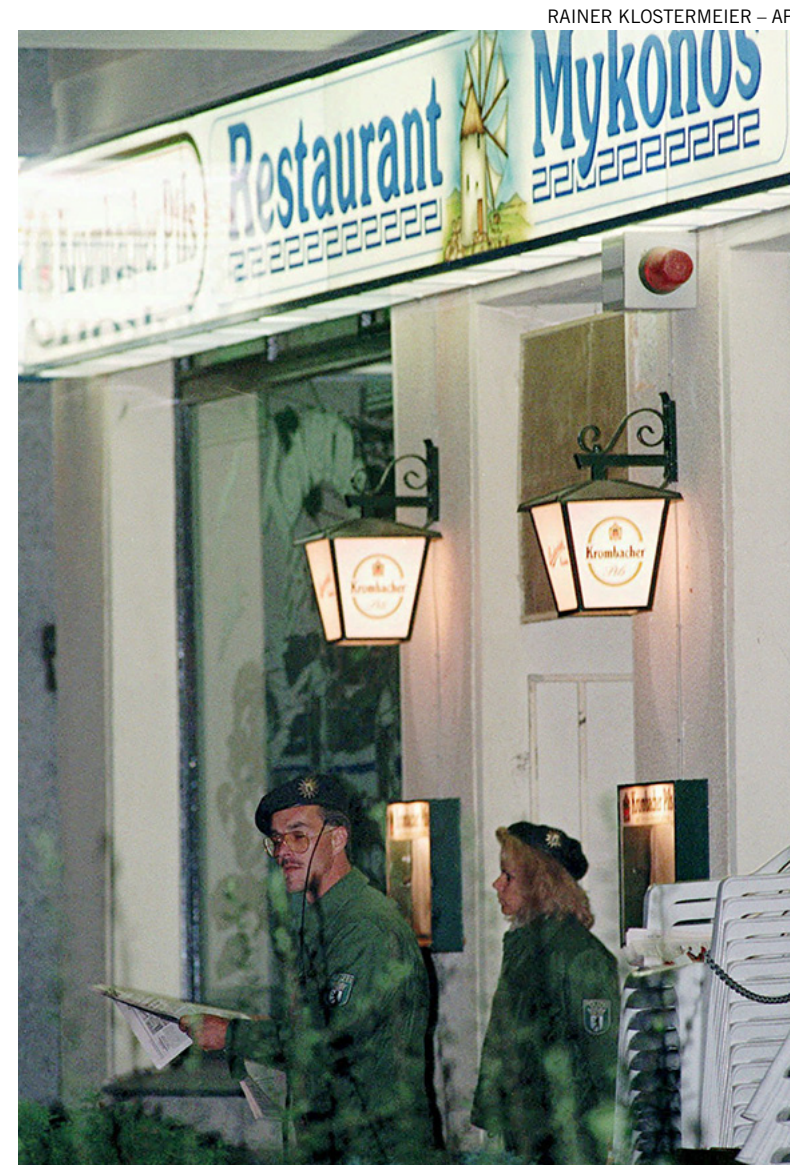
German police outside the Berlin restaurant.

Justice has been less swift. It has come in stages. The murders were committed at the Mykonos restaurant in Berlin on the night of Sept. 17, 1992. The trial of four men of the score or more in the plot did not conclude until